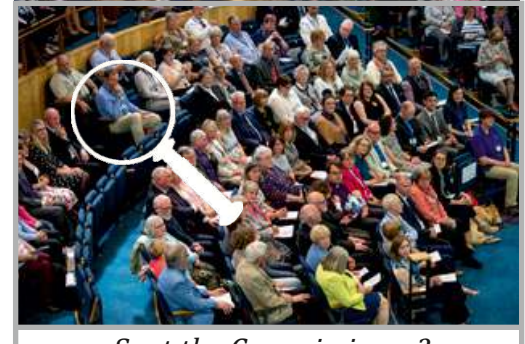
Spot the Commissioner?

along the back of the chair in front or rest on the shoulders of whoever is sitting in front. The Business Convener encouraged us all to circulate around the hall during the days of debate, "to allow us to make new friends", for me it was in search of legroom. I can assure you that I didn't sit in the same seat twice and I did eventually find a seat with room