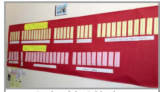
Books of the Bible chart

During the month of March we met with the church growth team and plans are moving forward to employ a youth worker . Your prayers and support for this role would be much appreciated.