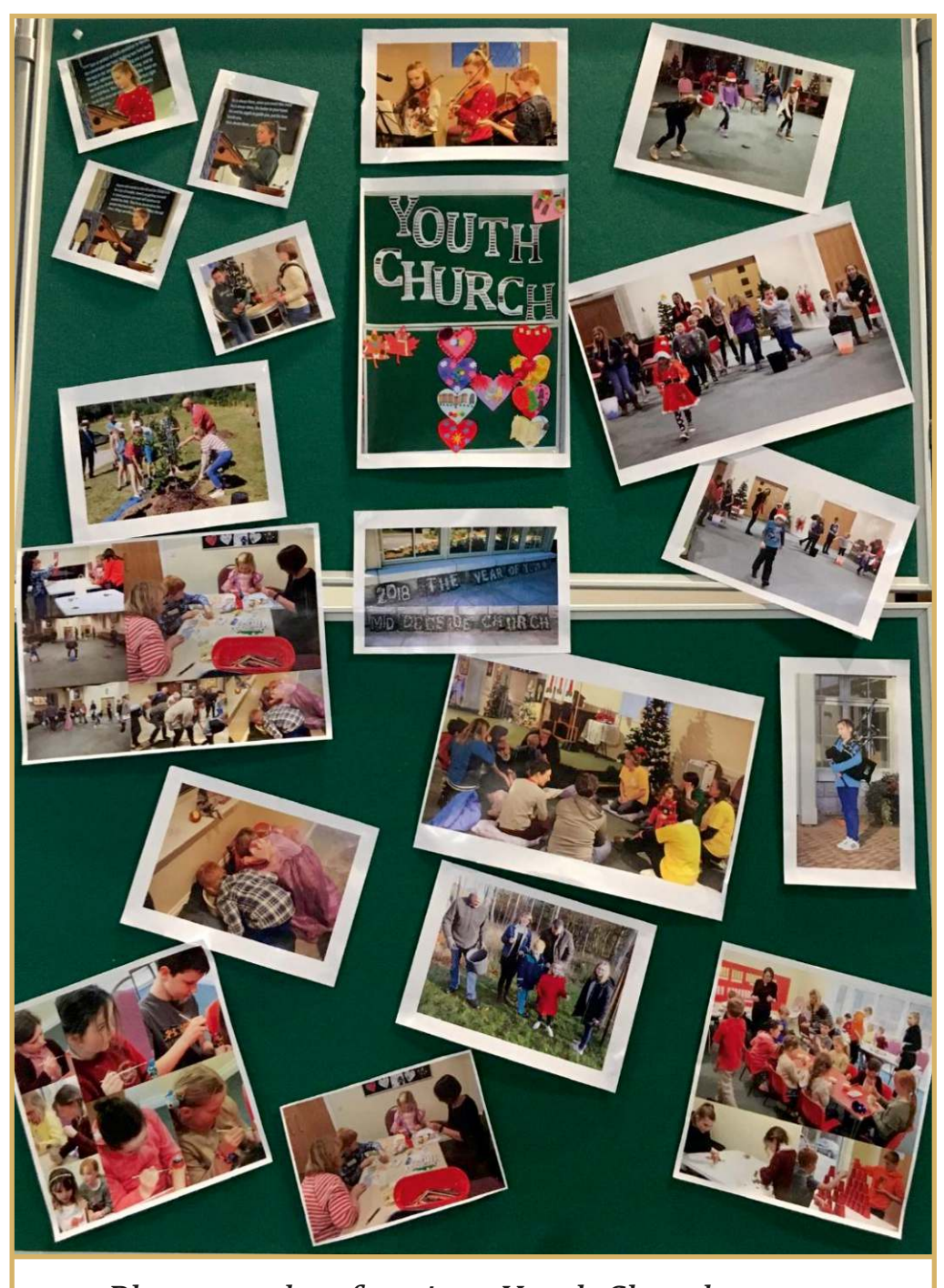
Photographs of various Youth Church events